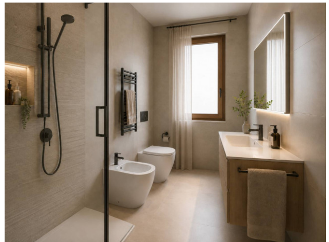
CONDOMINIO VIA PERAZZI 34 - NOVARA